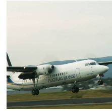
Reykjavik Domestic Airport

Web. http://www.airiceland.is/AirIceland/Information/Arrivalsdepartures/