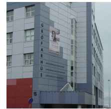
Reykjavík Public Library

Tel. 411 6100 Web. http://www.borgarbokasafn.is