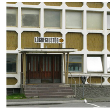
Reykjavík Police Station