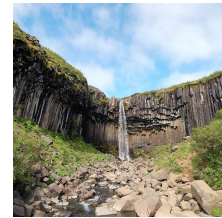
Skaftafell National Park

Tel. +354 470-8300 Web. http://vatnajokulsthjodgardur.is