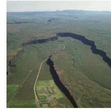
Jökulsárgljúfur National Park

Tel. 465-2195 Web. http://vatnajokulsthjodgardur.is