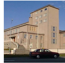
National Museum of Iceland

Open: Summer May 1st - September 15th: Daily 10-17 Winter September 16th - April 30th: Daily except Mondays 11-17 The museum is closed on Good Friday and Easter Sunday Free entrance on Wednesdays.