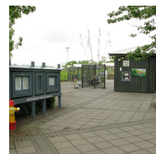
Reykjavik Zoo Family Park

Tel. 411 5900 Web. http://www.mu.is/in-english/