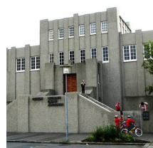
Einar Jónsson Sculpture Museum

Tel. 551 3797 Web. http://www.skulptur.is/