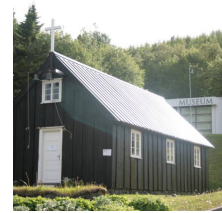
The Akureyri museum

Preserves the cultural history of the North.