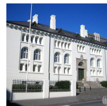
The Culture House

Tel. 545 1400 Web. http://www.thjodmenning.is