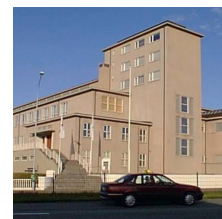
National Museum of Iceland

Open: Summer May 1st - September 15th: Daily 10-17 Winter September 16th - April 30th: Daily except Mondays 11-17 The museum is closed on Good Friday and Easter Sunday Free entrance on Wednesdays.