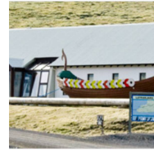
Minjasafn Egils Ólafssonar Hnjóti

A museum which contains unique collection of items from the Vestfjords. The museum is open only in summer from May 24th to September 13th, every day from 10:00 to 18:00. Entrance to the museum is 700 ISK but free for 16 years old and younger.