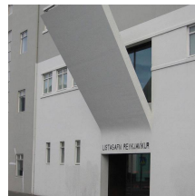
Harbour Art Museum

Tel. 590 1200 Web. http://www listasafnreykjavikur.is