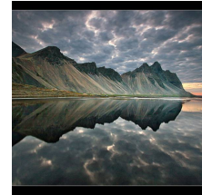
Höfn í Hornafirði

Tel. 478-1500 Web. http://hornafjordur.is