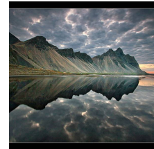
Höfn í Hornafirði

Tel. 478-1500 Web. http://hornafjordur.is