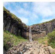
Skaftafell National Park

Tel. +354 470-8300 Web. http://vatnajokulsthjodgardur.is