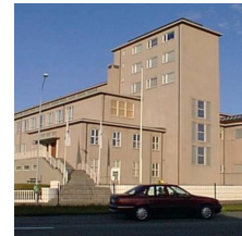
National Museum of Iceland

Open: Summer May 1st - September 15th: Daily 10-17 Winter September 16th - April 30th: Daily except Mondays 11-17 The museum is closed on Good Friday and Easter Sunday Free entrance on Wednesdays.